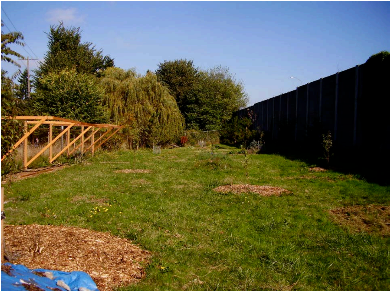
Young fruit trees in the center, with a trellis to the left and the Interstate 5 corridor to the right