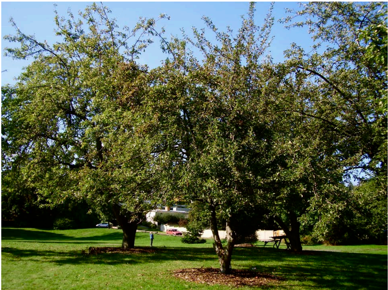
Apple and cherry trees at Martha Washington Park