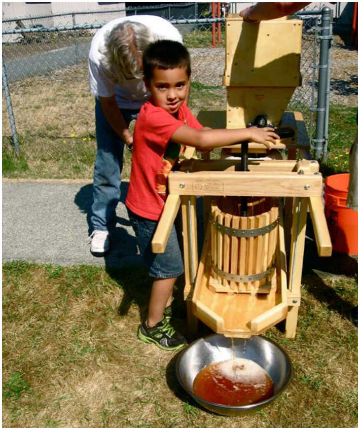
A young boy making apple cider at the Jubilee Country Fair at Holy Cross Church Orchard

Communities are trying to encourage more residents to participate in these orchard rejuvenation projects by engaging them in cider pressing, a historic tradition. As discussed earlier, cider pressing was of particular historical significance in colonial America because