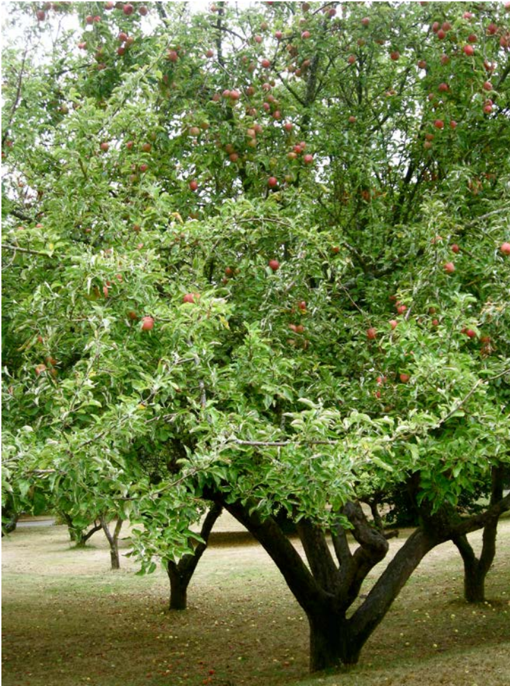
Apple tree at Holy Cross Church orchard