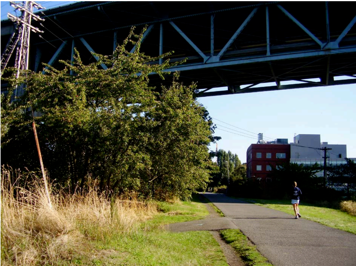
An old apple tree located along the Trail and under the Interstate 5 overpass

There are a lot of fruit trees scattered along the Burke-Gilman Trail that winds its way through Seattle. The fruit trees that are of particular note are the six located right by Gas Works Park. Not much is known about when these fruit trees were planted, but Barb Burrill, one of the community members involved in taking care of these trees, states that there are numerous fruit trees on the streets and in the backyards of residents in Wallingford, the surrounding neighborhood, that were planted long before the current residents bought the property. As such,