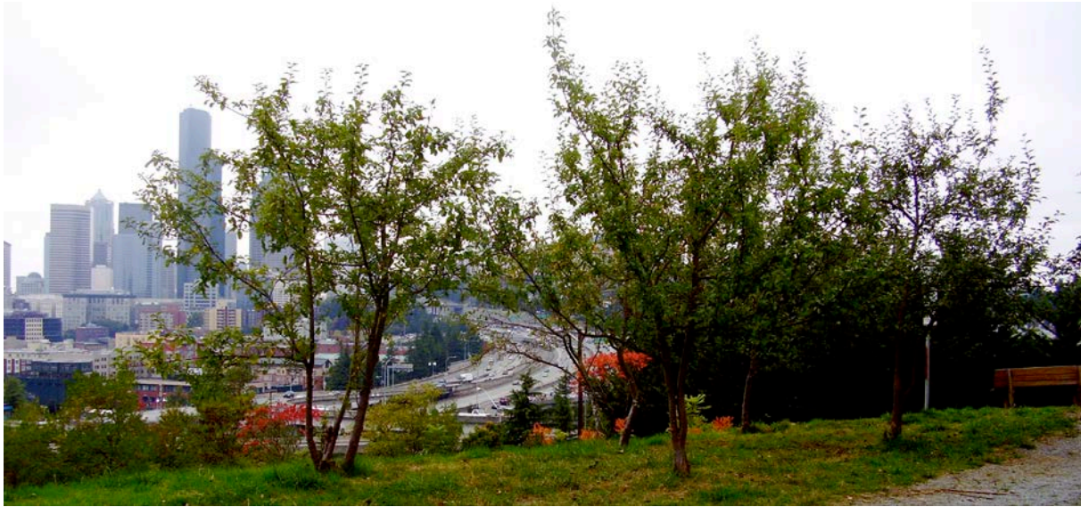
One of three different plots of orchards at Dr. Jose Rizal Park, overlooking Interstate 5 and downtown Seattle