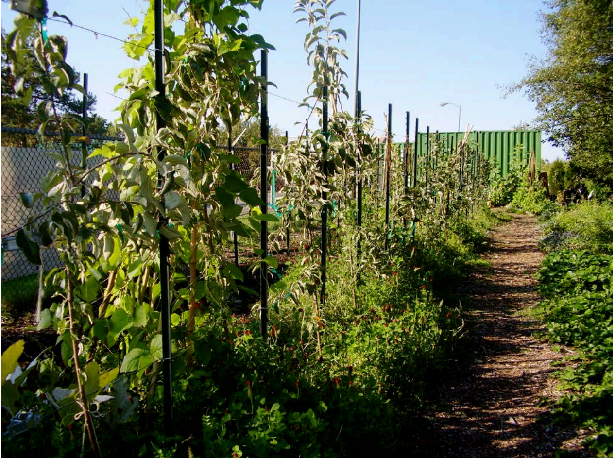
High-intensity trellising method for fruit trees at the Community Orchard of West Seattle