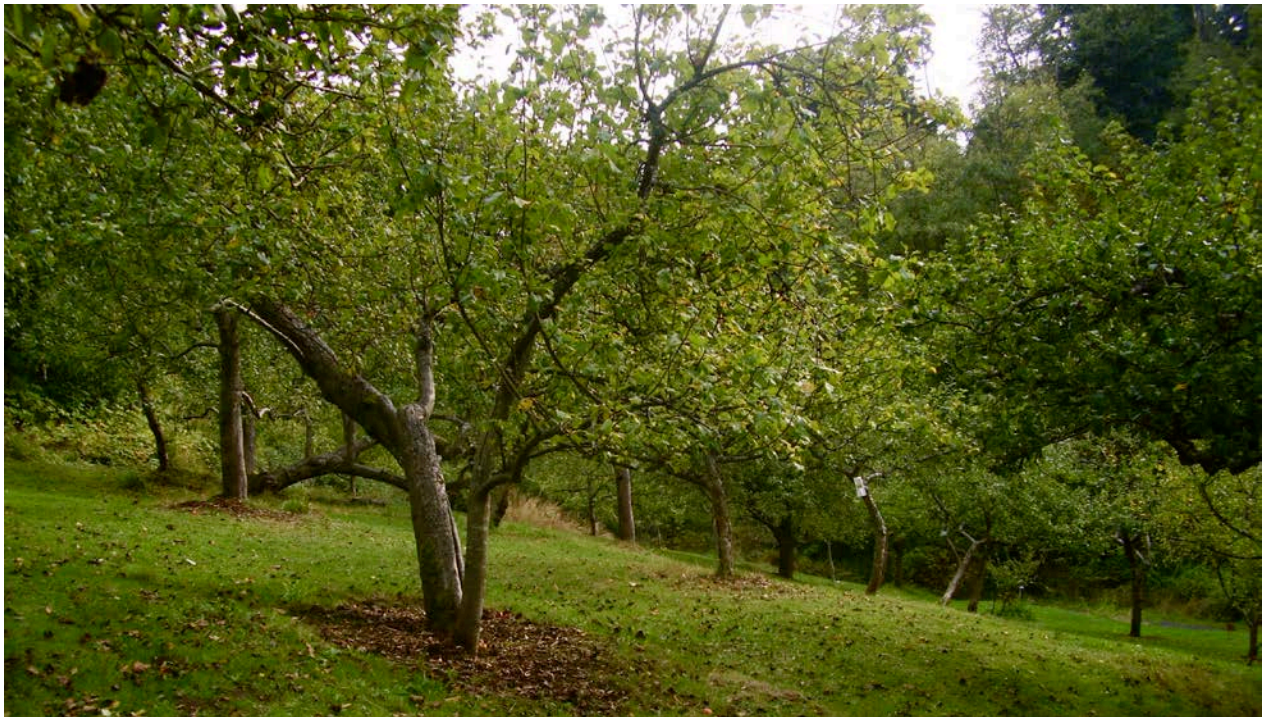
The historic orchard at Piper’s Canyon